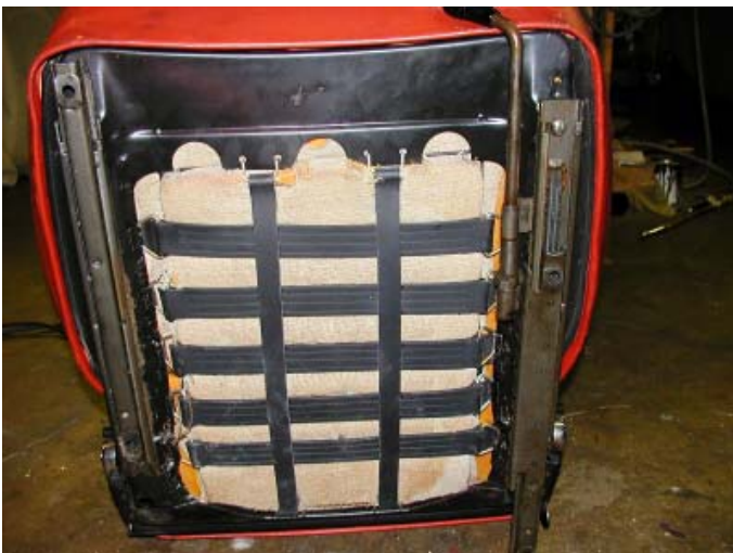
Seat bottom from a Khamsin. This one is in good condition, many times the webbing and/or seat cushion are breaking apart.

If the foam is disintegrating, a trip to an upholstery shop is in order. They should have no problems fabricating a seat cushion that matches the original one. Many times the foam is fine and the culprit is the lower diaphragm which holds the foam cushion in place. These too can be easily replaced. Sometimes all you need to do is add a extra piece of foam between the cushion and the diaphragm.