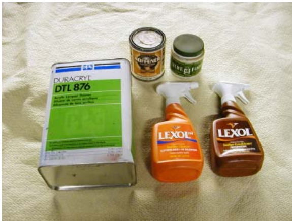
Lexol cleaner, Lexol conditioner, Color Plus Soffener, Hide Food, lacquer thinner

with soap and make sure it is COMPLETELY dry before continuing. It should take about one day to dry out, depending on temperature and humidity