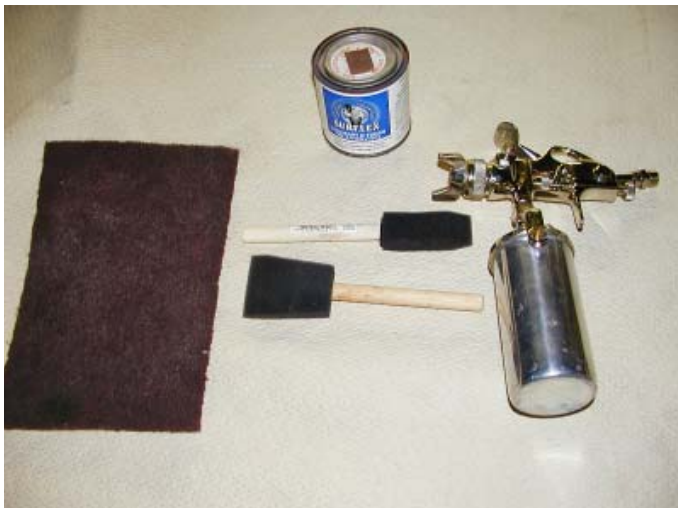
Surfex leather dye, sponge brush, touch up paint gun and 3M pad

Just before you apply the dye, take a clean rag with lacquer thinner and wipe the leather. This will leave the old dye sticky and the new dye will adhere better.