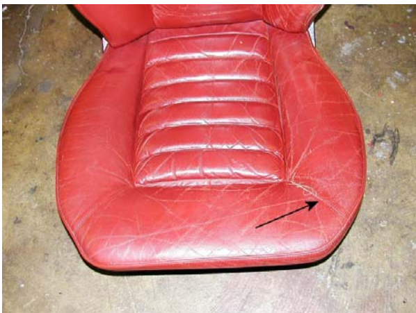
Driver's seat from a Khamsin shows some wear after 38 years. Notice one of the seams will need to be restched.

This is something you probably do not want to tackle yourself. The stitching NEEDS to be done from the inside of the leather. If you attempt to hand stitch from the outside I doubt you will like the results, it just will not look right. Many times when the stitches have opened it is because the leather around it has shrunk. In order to fix it properly the upholstery shop will need to replace some of the leather panels. Matching the color of the leather, unless it is black, will be close to impossible but do not worry since you will be redyeing it anyway. The trick is to get leather that has a similar grain to the original, the color is much less important (naturally, avoid using a red piece of leather if you are working on a white interior!). Remember our goal is preservation; do not let the upholstery shop talk you into replacing the whole seat ... replace as little material as possible.